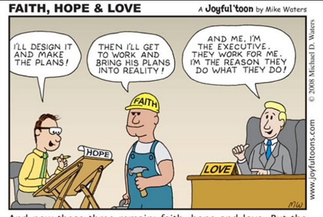
And now these three remain: faith, hope and love. But the greatest of these is love. -1 CORINTHIANS 13:13 NIV

In Your image we are made -Creative like You are, Forming goods for use and trade Just like You formed the stars. Send us out in power and skill To worship through each task assigned. By Your Spirit we fulfill Thy holy, grand design.