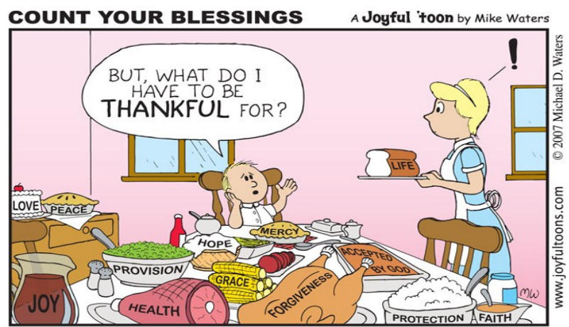
Bless the LORD, O my soul, and forget not all his benefits: - Psalm 103:2 _{\text{KJV}}

Now thank we all our God, With hearts and hands and voices; Who wondrous things hath done, In whom this world rejoices. Who, from our mother's arms, Hath led us on our way, With countless gifts of love, And still is ours today. - Martin Rinkart